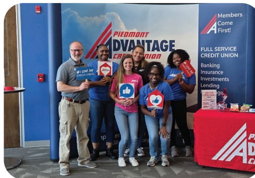
Advantage Way team members celebrating I Love My Credit Union Day.